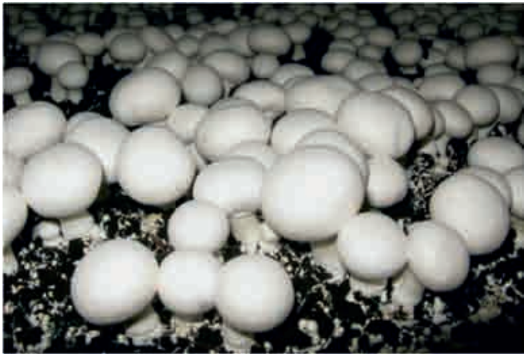
Modern mushroom cultivation under controlled temperature, humidity and light intensity