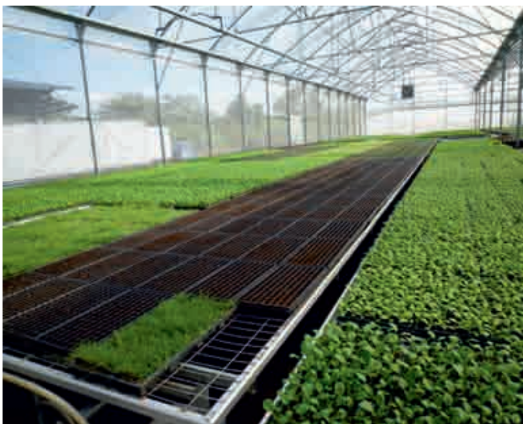
Modern automatic seed sowing and mass production of seedlings to raise production efficiency