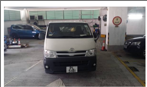
DV Front View