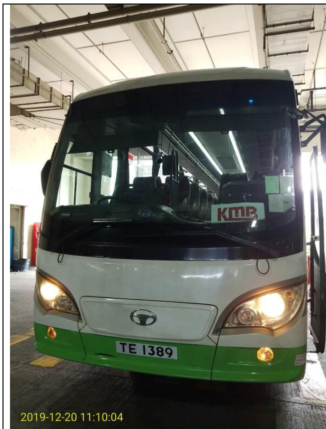
Front view of DV (TE1389)