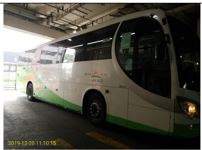
Right side view of DV (TE1389)