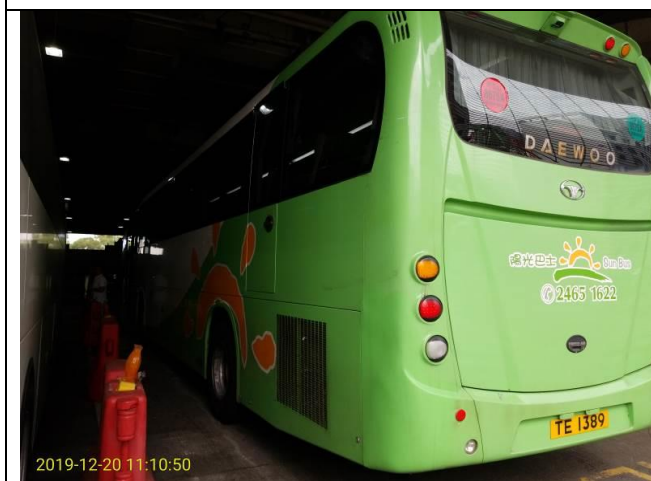
Left side view of DV (TE1389)