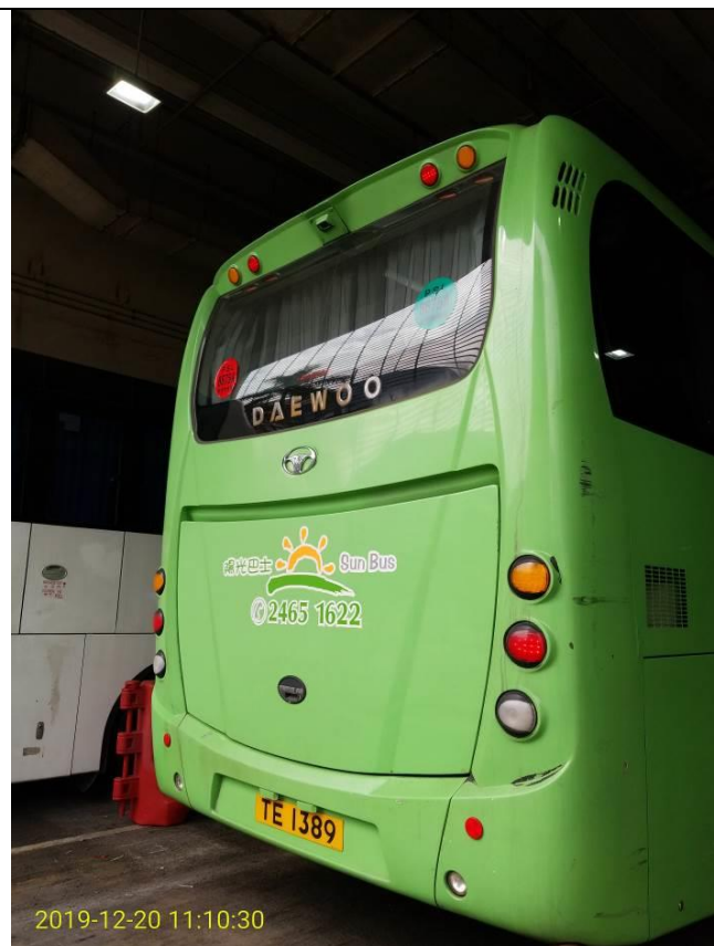
Rear view of DV (TE1389)